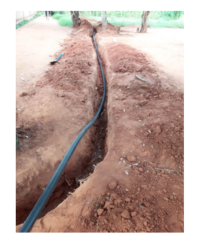
Figure 4 Laying 1Km of pipe

The water is sold at low cost to the local people as a goodwill and relationship building outreach for the church.